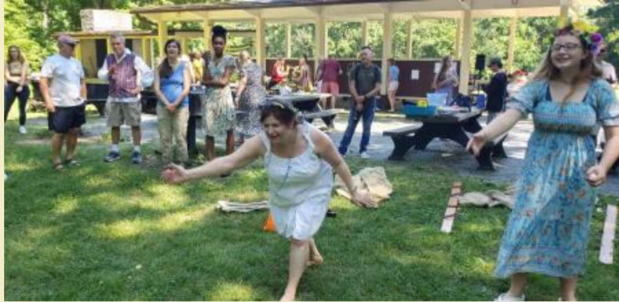
Picnic and mingle