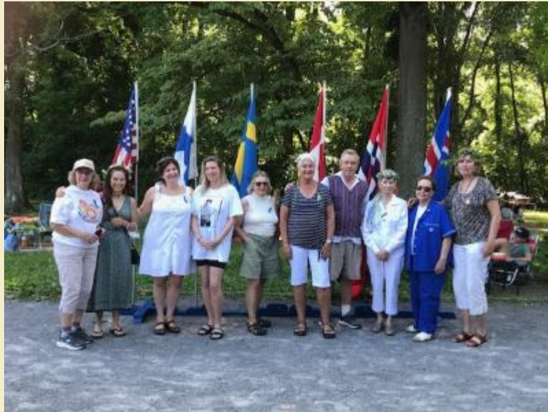
Drott Lodge Membership Awards

After so many months (or years) of social distancing, at long last we were able to host a great celebration back at Carderock Park for joint Midsommar. A beautiful summer day with sunshine and low humidity made the day more enjoyable than any in recent memory. With several local Scandinavian groups, including our friends at ASA and Finlandia Foundation, our group was large enough to fill the park, fill the pavilion and surrounding space with picnickers, decorate a beautiful maypole, complete several lively rounds of children games (many of our adults joined in as well!), Kubb game, and of course – dancing around the maypole to live music from our fiddlers.