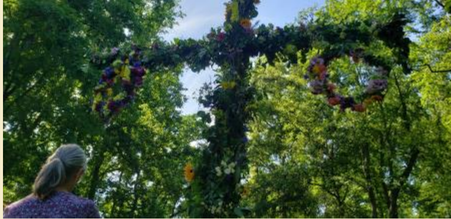
Traditional dance around the May pole