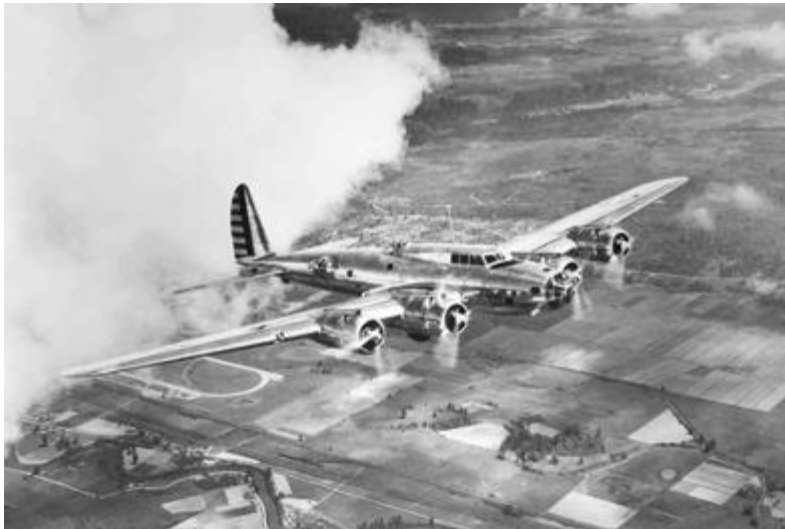
Image: B 17 (Liberator) World War II bomber in Flight

This special program features commentary by Bob Dyer describing the history of events on a little-known historical occurrence in the annals of Swedish and American history: Sweden's role in hosting thousands of U.S. airmen during World War II. When the aviators had to make forced landings of their "flying fortress" aircraft after bombing runs in Germany, many American airmen ended up interned in Sweden, where they recuperated from injuries; some spent many months in Sweden.